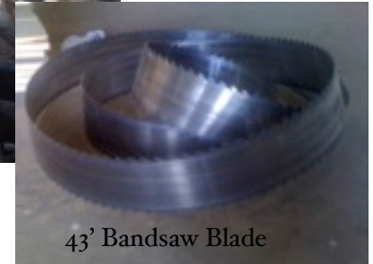
43' Bandsaw Blade

After the tour, club members enjoyed a fine lunch of pasta, pizza and chicken and then shopped for turning blanks and lumber. Doll has a very nice selection of high-quality turning stock and lumber, all at very good prices. While the tour alone was worth the trip, the selection and price of Doll's turning stock also made the trip worthwhile.